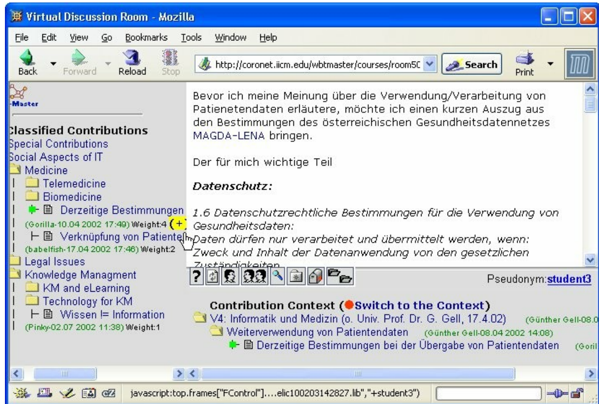
Figure 1: Voting mechanism for classification of contributions

The category structure and the contribution assignments are then utilized to improve search and navigation facilities. In addition, the predefined taxonomy might be altered on-the-fly, i.e. the taxonomy is flexible in the sense that it can be extended, the categories can be modified and deleted by the users of the system. In a sense it is a similar approach to the concept of “folksonomies” with the difference that it takes more of a top-down approach (a session is started with a predefined taxonomy) and the relations between categories are always hierarchical.