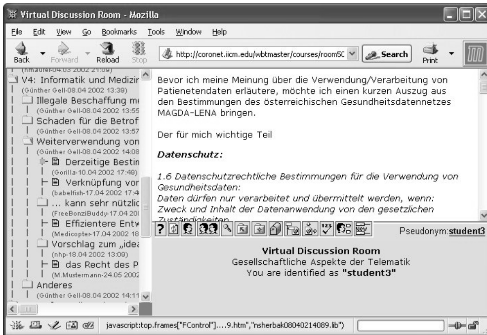
Figure 1: Working with Discussion forum

Users may of course choose to work with the conceptual schema directly by activating a special button. As a response the system visualizes the conceptual schema with assigned contributions. Note that users working directly with the conceptual schema may vote for or against assignments made by other users (see Figure 3.). Each positive vote increases the “weight” of an assignment, thus making it more trustworthy.